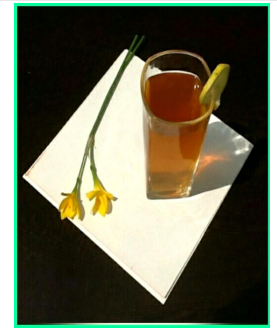
Herbal Drink (b)